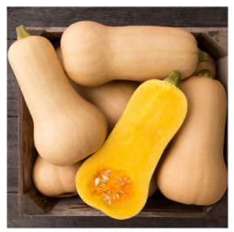
BUTTERNUT, WALTHAM - Delicious butternut squash. High yield and excellent for storing.