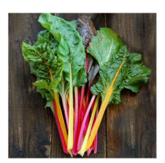
RAINBOW CHARD – Beautiful multi-colored variety.