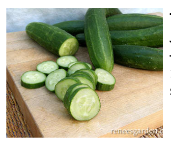
TASTY GREEN JAPANESE CUCUMBER

The most popular pickling cucumber raised by home gardeners. Heirloom bush variety, produces a large abundance of wonderful little, medium green colored cucumbers.