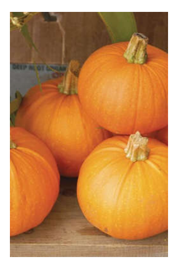
SUGAR PIE – Classic pie pumpkin with dry, stringless flesh and superior thick consistency in pies and soups.