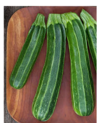
COCOZELLE - Beautiful lightly ribbed Italian heirloom. Great flavor.