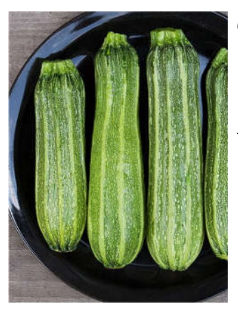
COSTATA ROMANESCO - Ribbed Italian heirloom. Excellent taste and texture.