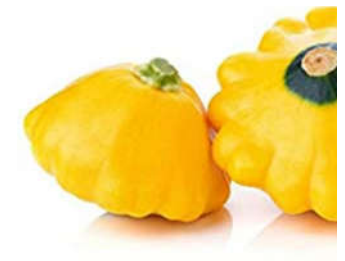
YELLOW SCALLOP -Yellow scallop-shaped squash with delicate flavor.