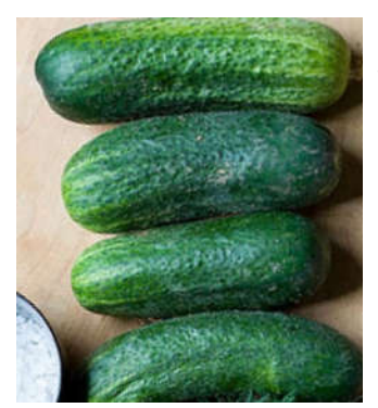
HOMEMADE PICKLES –

FINGERS – A garden favorite! Delicious 4-5" baby cucumbers, very productive plants.