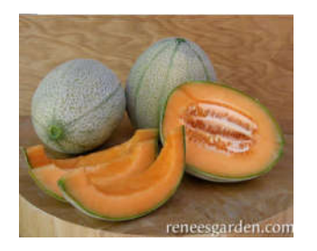
TUSCAN MELON – Heirloom Tuscan Melon is a orange-fleshed melon with a perfumed aroma and exceptionally sweet flavor