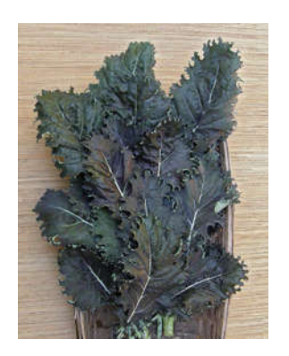
MARS LANDING – Tender, mild and very tasty variety holds well in the garden without getting tough or stringy. Gorgeous purple/maroon color with light green underneath.