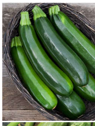
DARK STAR – Vigorous, dark-skinned variety. Drought tolerant.