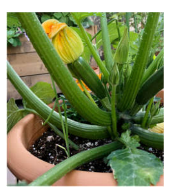
ASTIA – Very prolific and delicious. Good for container planting.