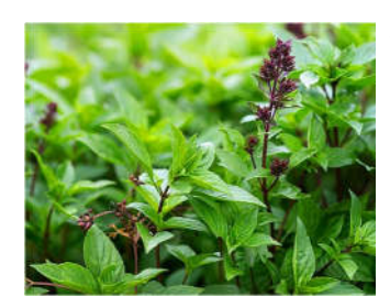
THAI BASIL – Fragrant and sweet. Great for Thai cooking.