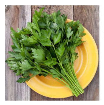
ITALIAN FLAT LEAF PARSLEY - Classic flat leaf variety.