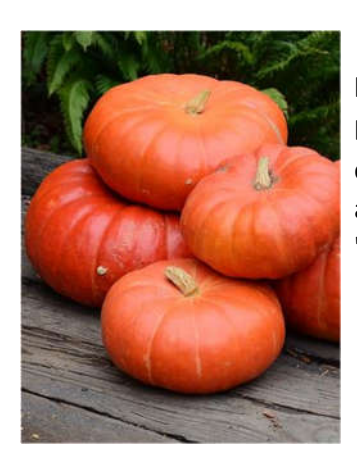
ROUGE VIF D'ETAMPES – stunning color and shape as well as good taste, aka 'Cinderella's Carriage'.