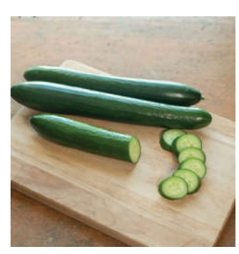
unagl – A new variety which is a cross between a Mediterranean and Asian cucumber. 9-11" long fruits with excellent flavor. Plants are very disease resistant. This was the best producing variety at our garden last year!