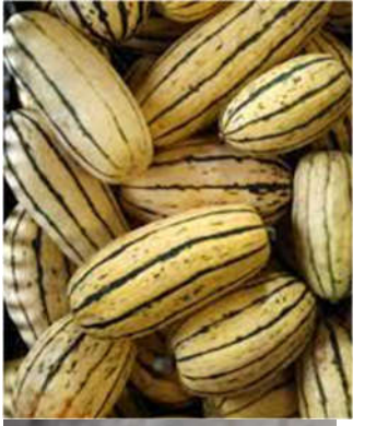
DELICATA – Very sweet, great flavor with thin skin. Produces early.