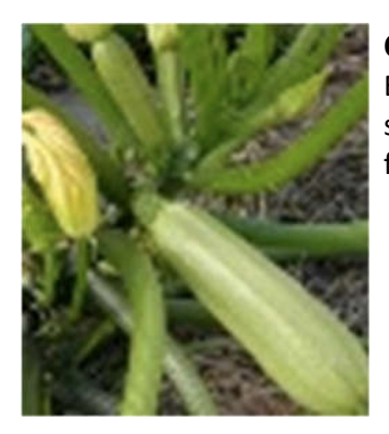
CLARIMORE – Middle Eastern light green squash with nutty, sweet flavor.