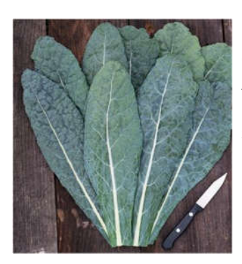
LACINATO TUSCAN – Classic Italian variety. Also known as Tuscan or Dino kale. Great for salads.