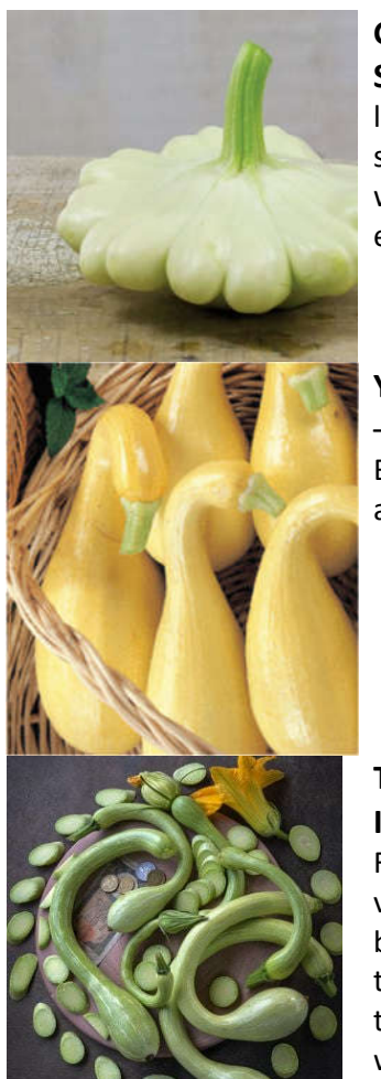
GREEN SCALLOP SQUASH - Colorful, light green, scallopshaped fruit; tender, with excellent yields, and easy to grow.