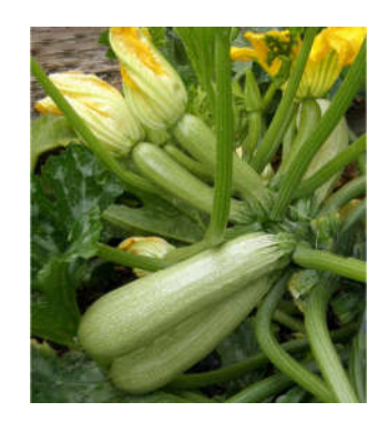
ORTOLANA DI FAENZA ZUCCHINI

Italian heirloom, yields light green, meltingly tender fruits. Early bearing and productive.