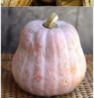
KOGINUT (Autumn Frost) A cross between butternut and kabocha squash. Creamy and smooth texture when cooked, with a sweet buttery flavor.