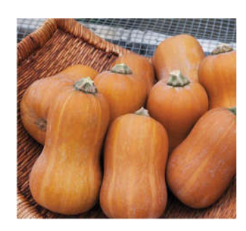
HONEY NUT – New! Smaller but extra sweet butternut squash