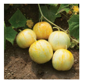
LEMON CUCUMBER -

Thin skinned crispy 10-12" fruits with excellent sweet flavor