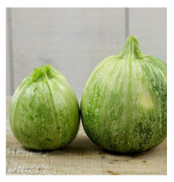
RONDE DE NICE – French heirloom round shaped zucchini.

Italian heirloom, yields light green, meltingly tender fruits. Early bearing and productive.