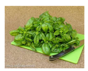
ITALIAN PESTO GENOVESE BASIL – Perfect for pesto.