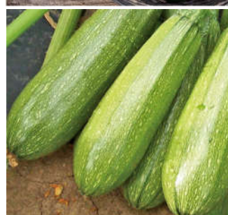
GREY ZUCCHINI – AKA 'Mexican Squash'. Beautiful pale mint green summer squash with grey speckles and delicious flavor. Heat resistant and very productive. Best harvested at about 6".